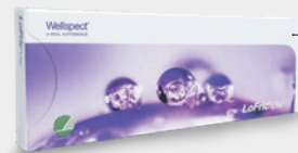
Sample pack, 5 catheters.

*Effective length, length of the catheter that can be inserted into the body.