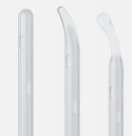
Nelaton Coudé Flexible Coudé

Foldable into handy, discreet pocket size.