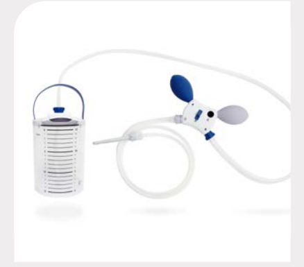
Navina Classic - manual control unit that is easy and intuitive with color coded pumps.