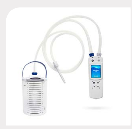
Navina Smart -Electronic handling with personal settings for precise, safe and controlled sessions.