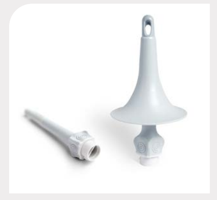
Navina Irrigation System can be used with either a rectal catheter for children or a rectal cone.